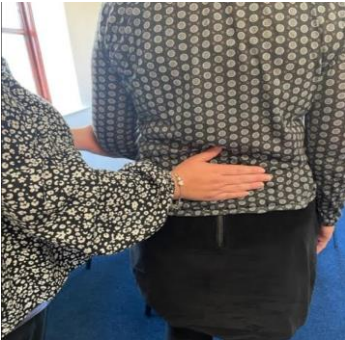
Reference: Guiding 3