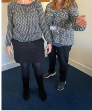
Reference: Prompting 2