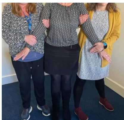
Reference: Straight arm immobilisation 6