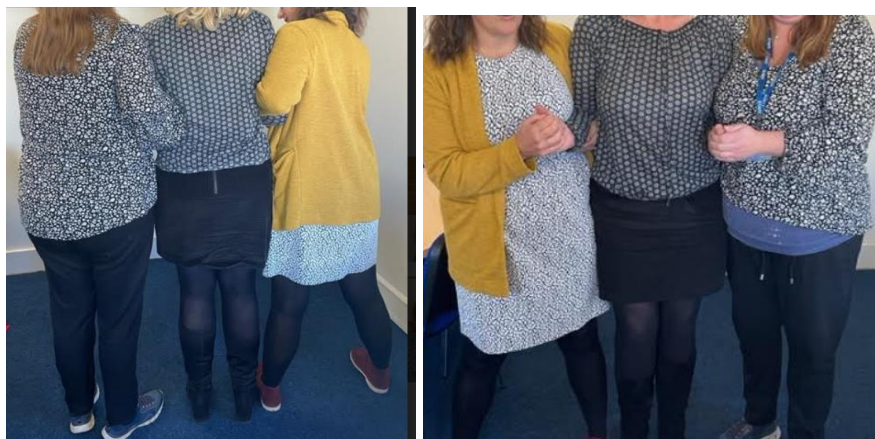
Reference: Double cup hold 5