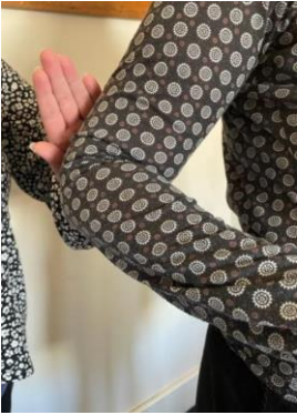
Reference: Prompting 1