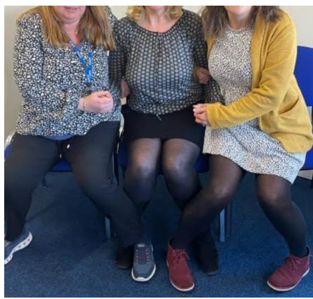
Reference: Seated kicking position 8