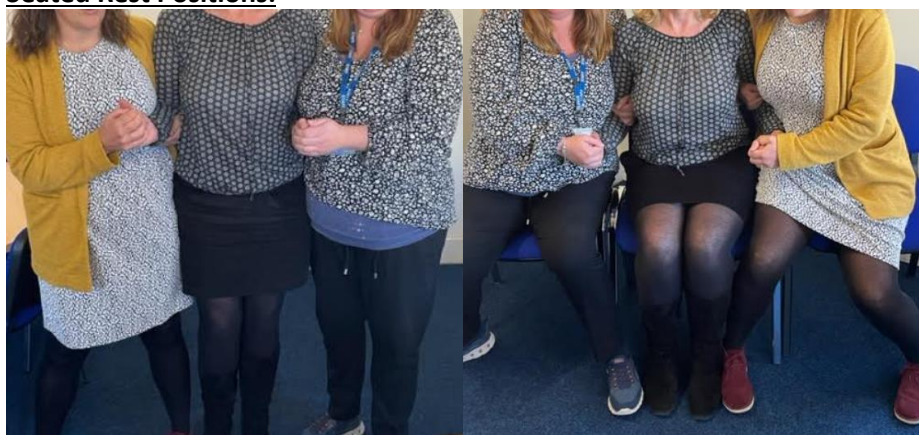
Reference: Seated rest position 7