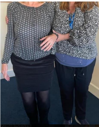
Reference: Escort 4